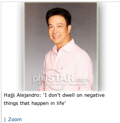
Hajji Alejandro: 'I don't dwell on negative things that happen in life'

DIRECTLINE By Boy Abunda (The Philippine Star) Updated June 08, 2011 12:00 AM Comments (0)